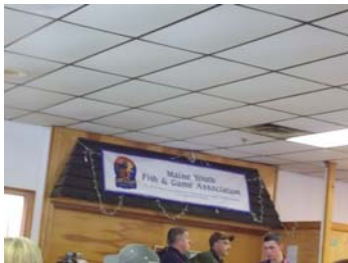
Banner at the Youth Fish & Game Association Fund Raiser